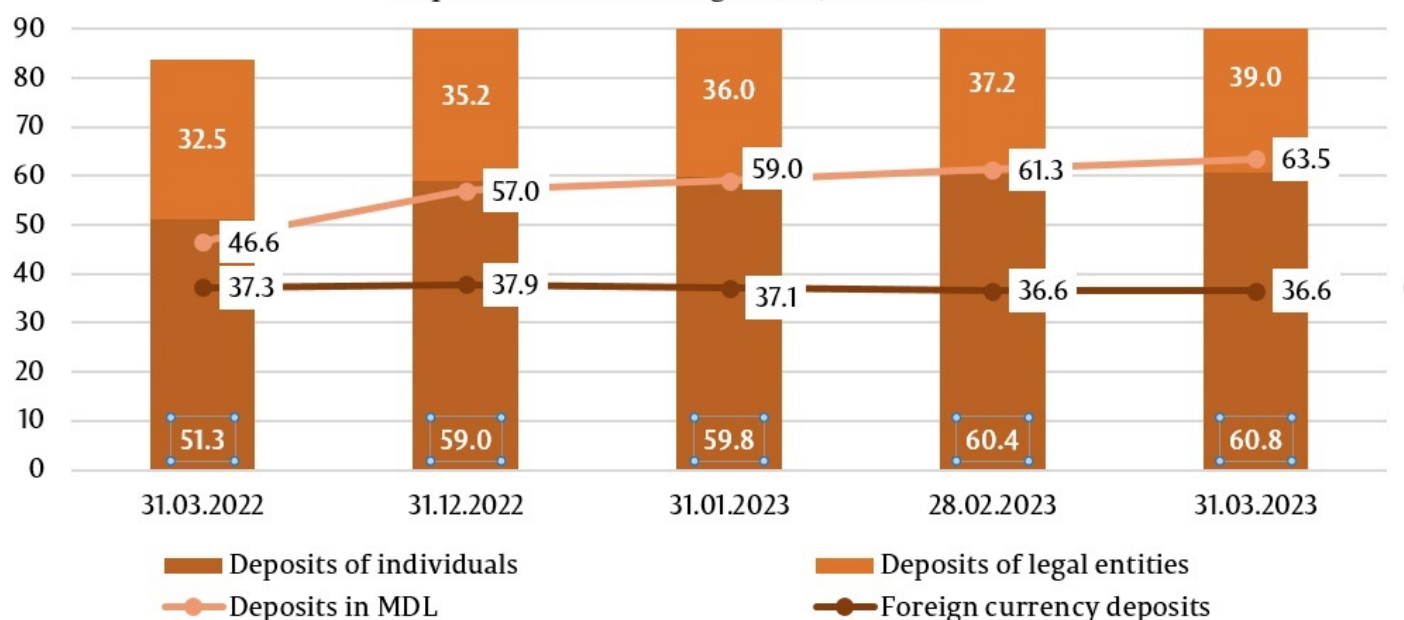
Deposits of the banking sector, billions lei

In total deposits, 63.4% went to deposits in MDL, their balance increasing by MDL 6.5 billion (11.4%) compared to the end of the previous year and amounted to MDL 63.5 billion on March 31, 2023. Foreign currency deposits accounted for 36.6% of total deposits, their balance decreased during the reference period by MDL 1.3 billion (3.4%), making up MDL 36.6 billion (withdrawal of foreign currency deposits - equivalent to MDL 382.9 billion, negative revaluation of foreign currency deposits – MDL 901.2 billion).