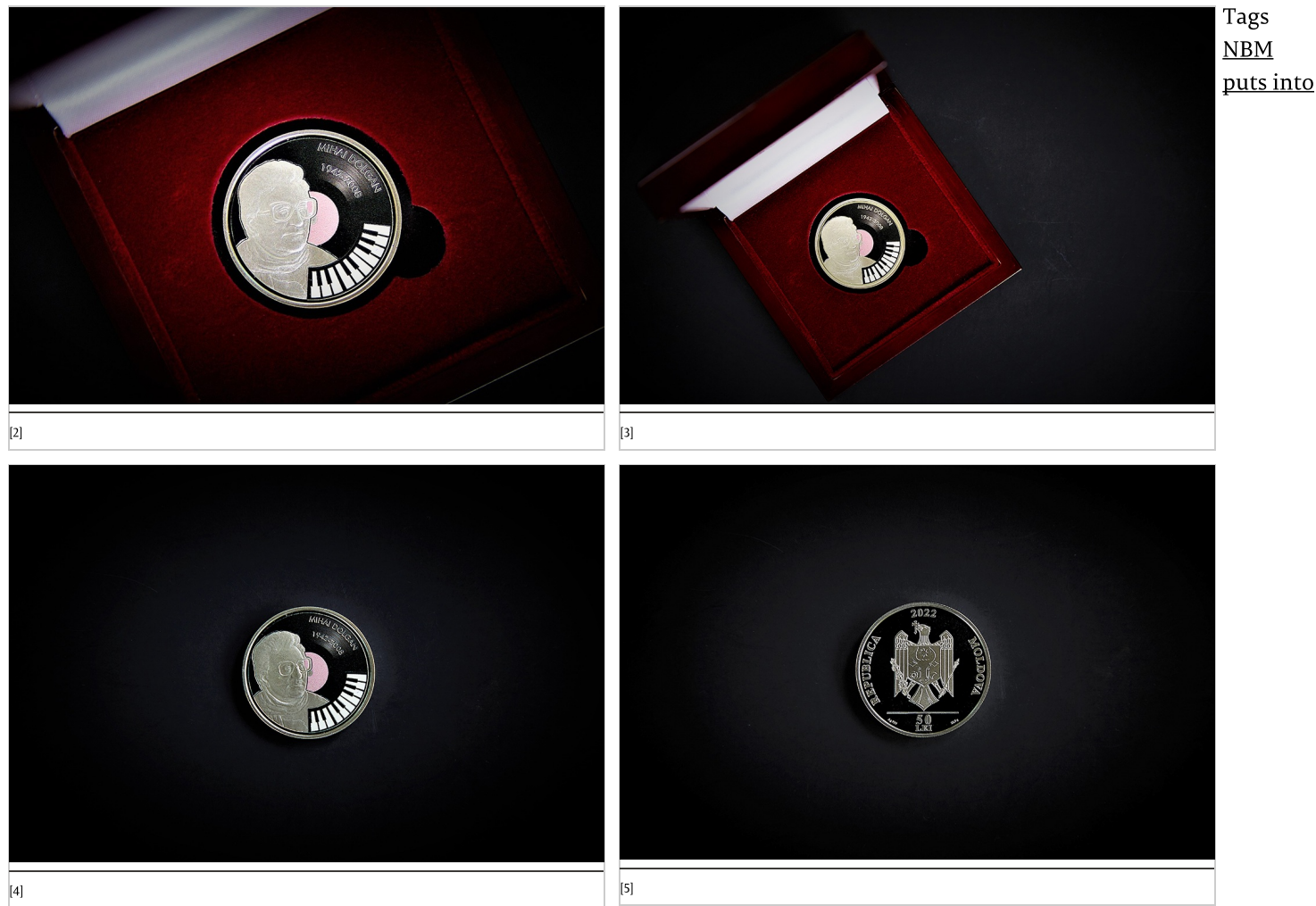
the 80th anniversary of the birth of Mihai Dolgan [7] circulation a new commemorative coin [6]

Source URL: http://www.bnm.md/en/content/nbm-puts-circulation-new-commemorative-coin-0