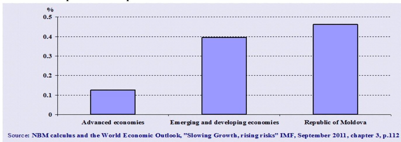
Chart no. 1. The impact of local food prices increases on overall situation

In case of fuel prices increase, the effect on core inflation growth is significant. An increase of 1.0 percent will have a cumulative impact on core inflation in the medium term of 0.33 percent. Food prices are also affected by an increase of 0.50 percentage points.