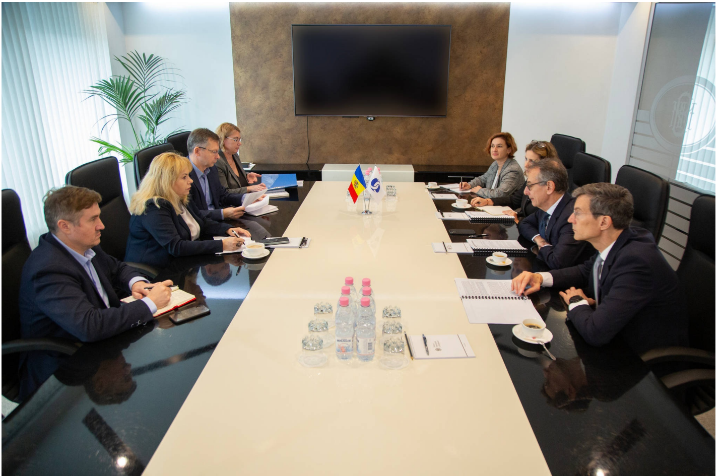
Tag-uri a meeting with the EBRD delegation [1]