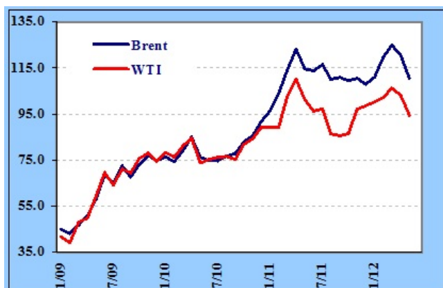
Chart no.1. Average monthly price of Brent and WTI oil (USD/barrel)

The oil extracted worldwide is not uniform in quality and, consequently, in price. Prices depend on the density, fractions, etc. The standard used for pricing is the Brent Crude oil type (hereinafter Brent), similar by composition with that extracted from the North Sea, and the supply contracts, which are concluded at London Stock Exchange. For a long time, Brent's price was by an average of USD 1 per barrel below the WTI (West Texas Intermediate or Texas light sweet) and by USD 1 per barrel above the price of the so-called "OPEC reference basket". However, in the recent years, this situation changed and the Brent is traded at a premium to WTI, the situation being mainly generated by the disruption of oil supplies from many regions to Europe (Chart no.1).