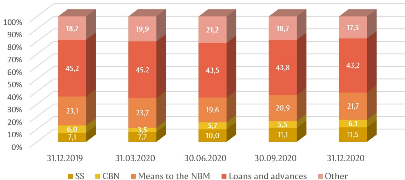
Structure of assets (%)

The gross (prudential) balance of loans constituted 43.9% of total assets or 45.6 billion lei, increasing during the analyzed period by 13.1% (5.3 billion lei). At the same time, the volume of new loans granted during 2020 decreased by 1.58% compared to the same period of the previous year.