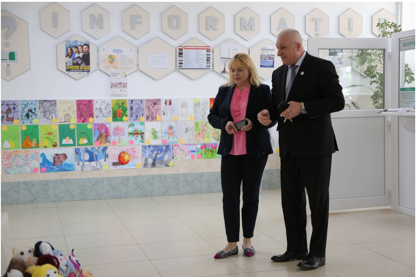
Метки an interactive financial education session at the [1]