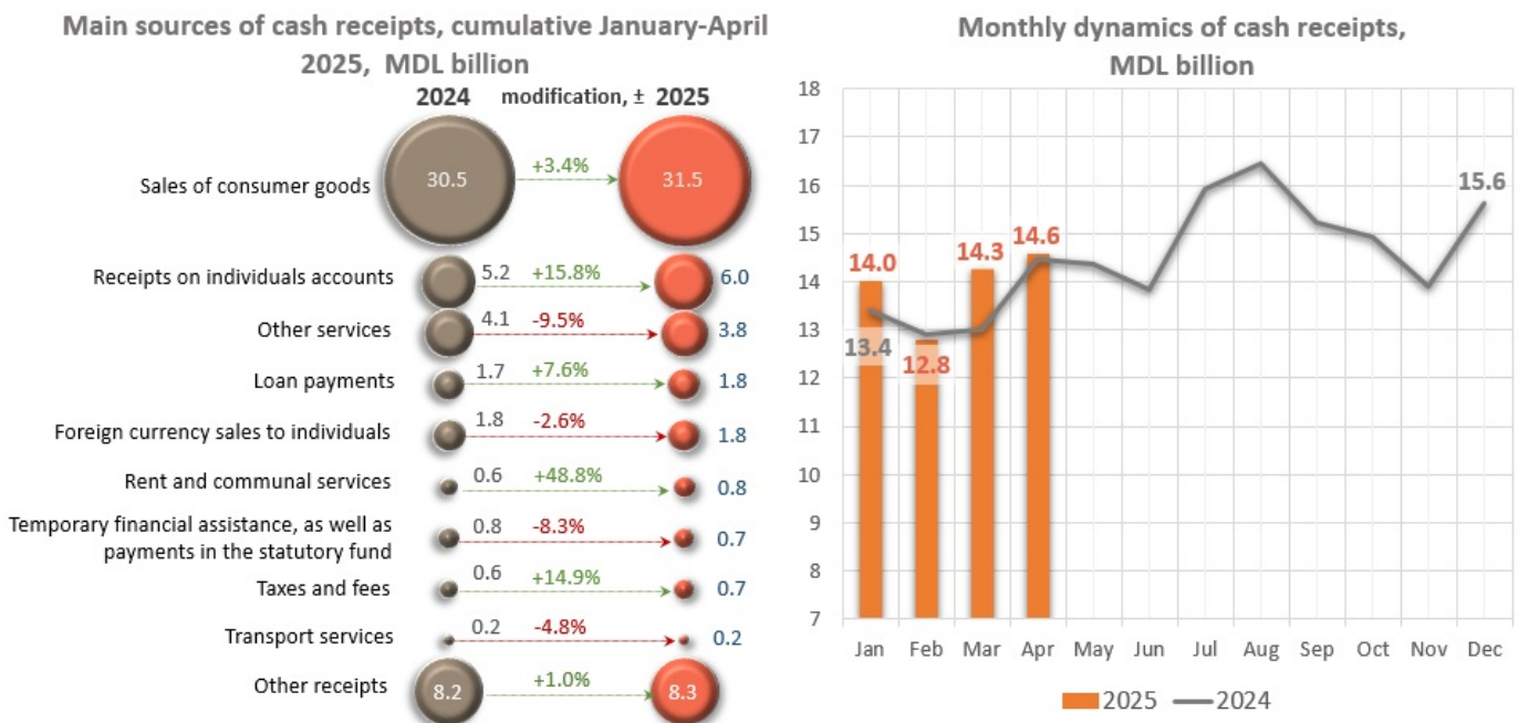
Chart 1. Main sources of cash receipts in bank vaults and their monthly dynamics 2

At the same time, the receipts from other services decreased substantially by MDL 392.2 million (-9.5%).