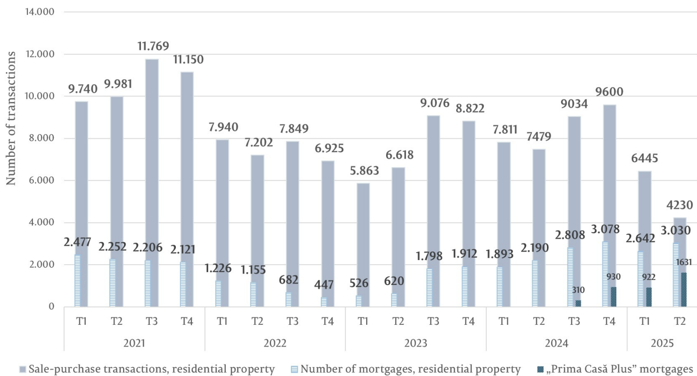
Figure 2. The volume of residential real estate sale and purchase transactions at the national level